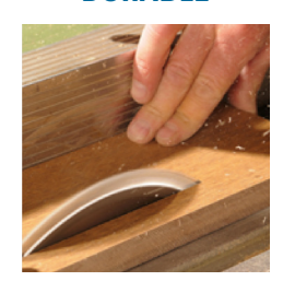
CUTS LIKE WOOD