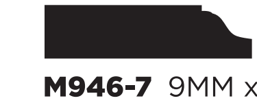
M946-7 9MM x 1-3/8