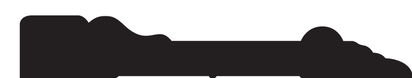
M535 18MM x 3-1/2