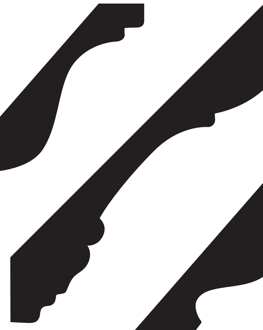
MPCR65 20MM x 5-5/8