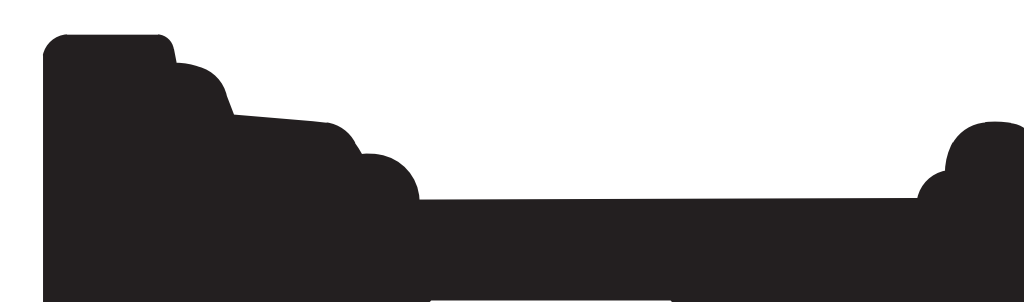
M5010 1-3/16 x 4-1/4