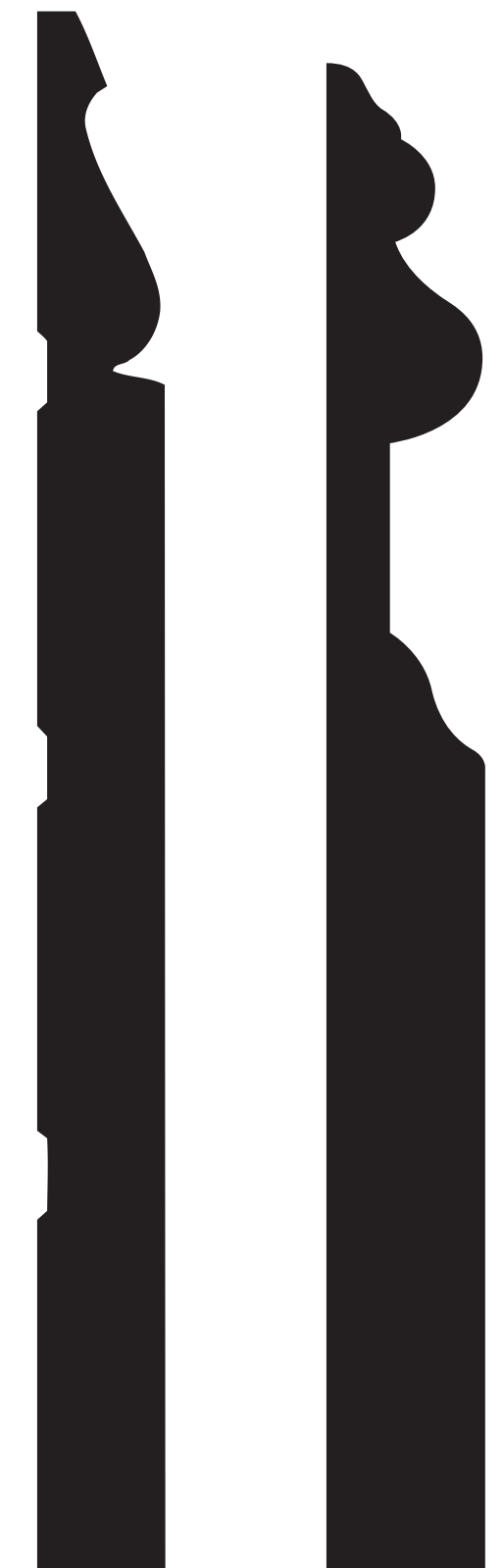
M163E7 15MM x 7-1/4