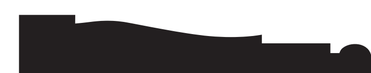
M445 15MM x 3-1/4