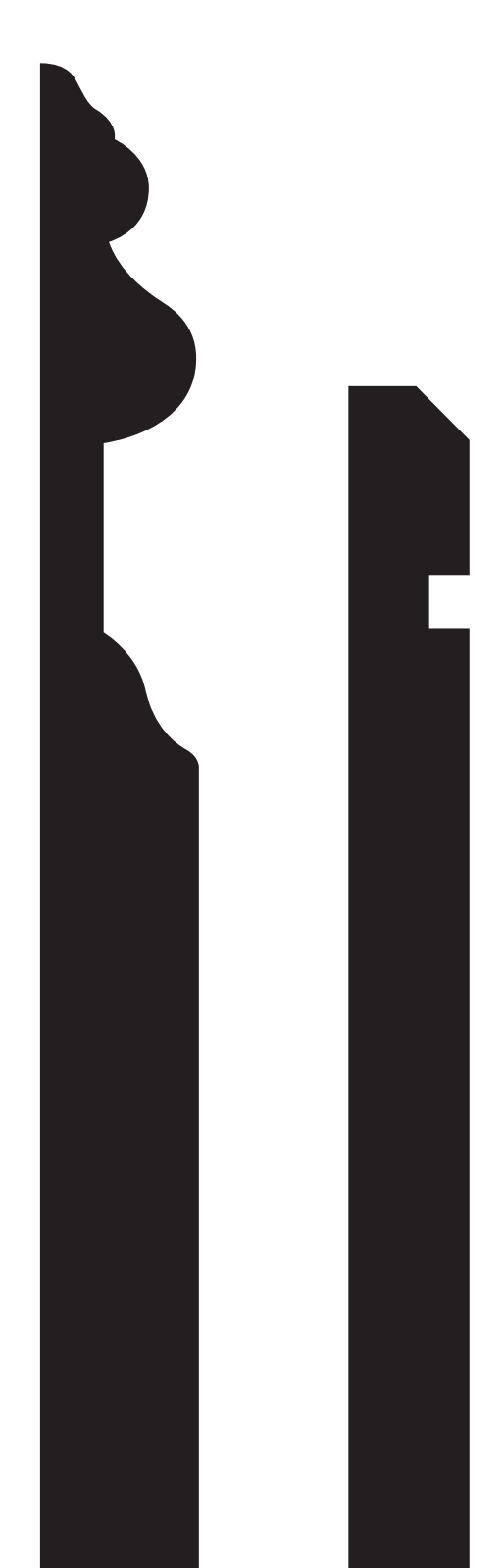
MPB7 18MM x 7