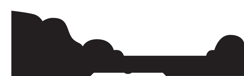
MRB3 25MM x 3-1/2