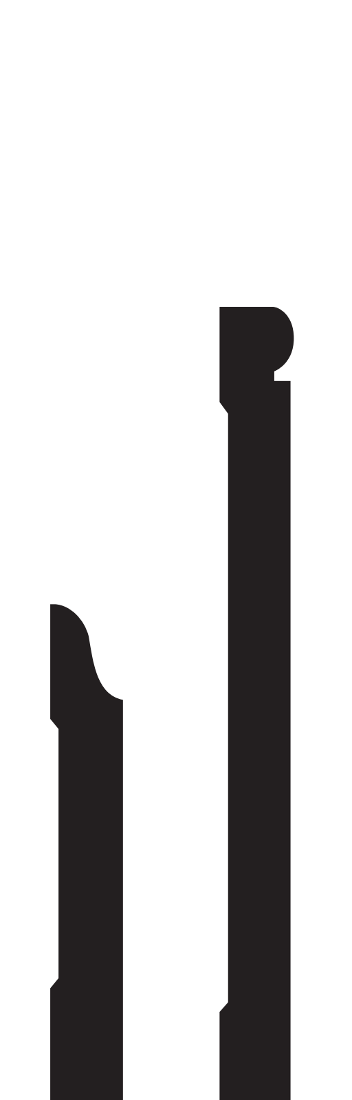
M618 12MM x 5-1/4