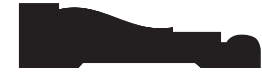
M376 15MM x 2-1/4