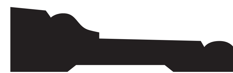
M97 25MM x 3-1/2