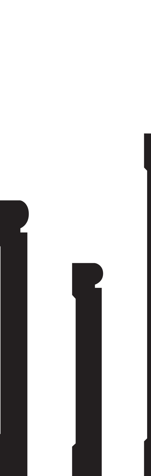
M620 12MM x 4-1/4