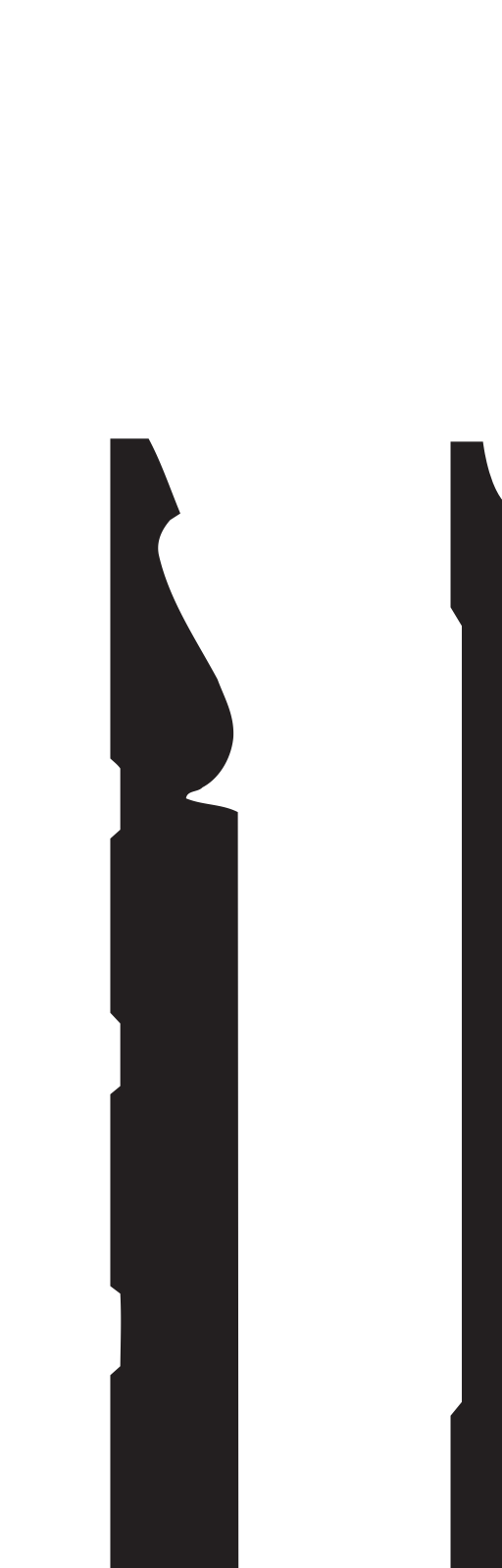
MCB512 14MM x 5-1/2