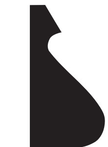
M163 18MM x 1-3/8