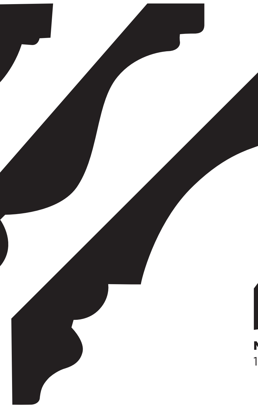
MPCR7 25MM x 7-1/4