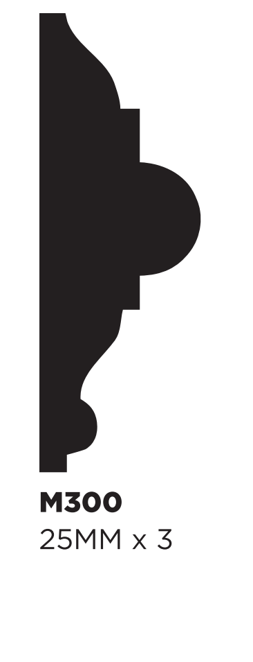
M300 25MM x 3