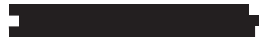
MNICKEL6 15MM x 5-3/16