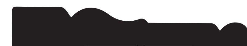
MJW9721 15MM x 3-1/2