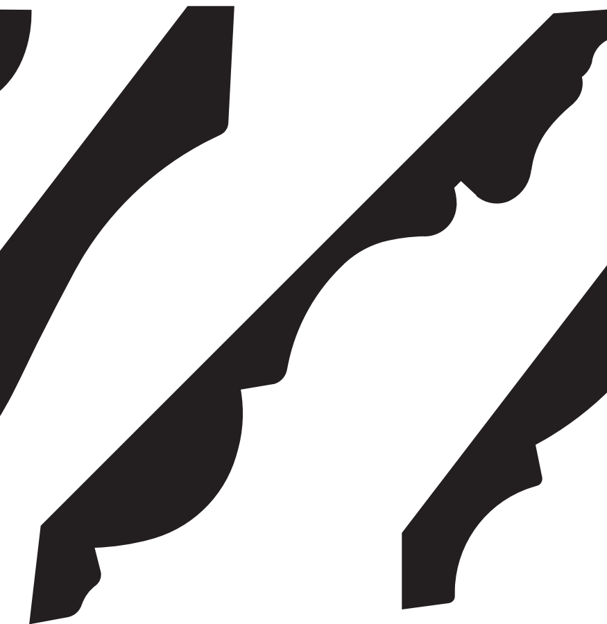
M830 17MM x 5-1/2