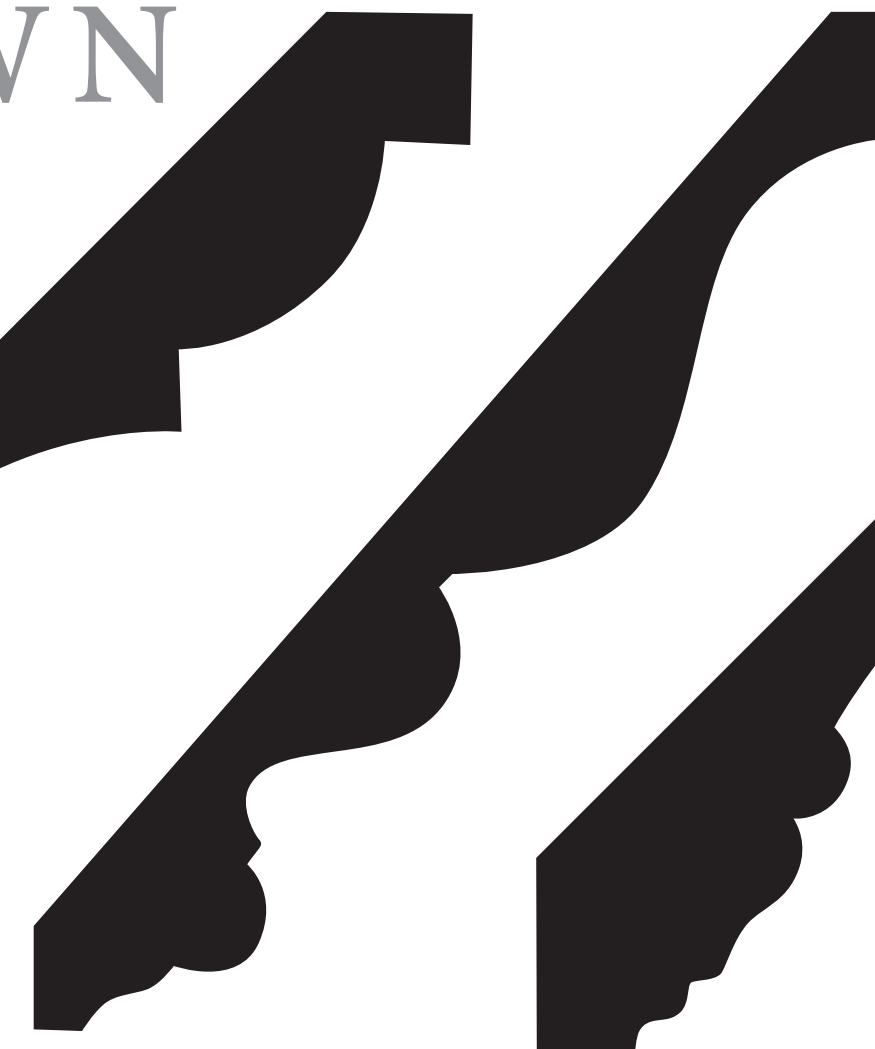
M271 17MM x 5-1/4