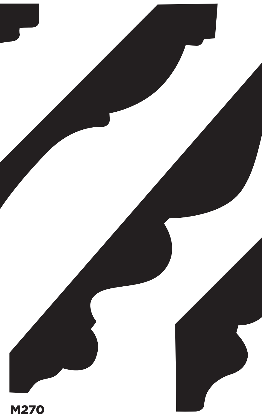
M270 17MM x 6-3/4