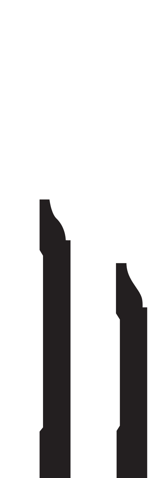
MC163E 15mm x 5-1/4