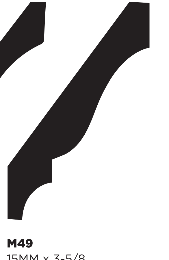
M49 15MM x 3-5/8