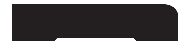
M452 14MM x 2-1/2