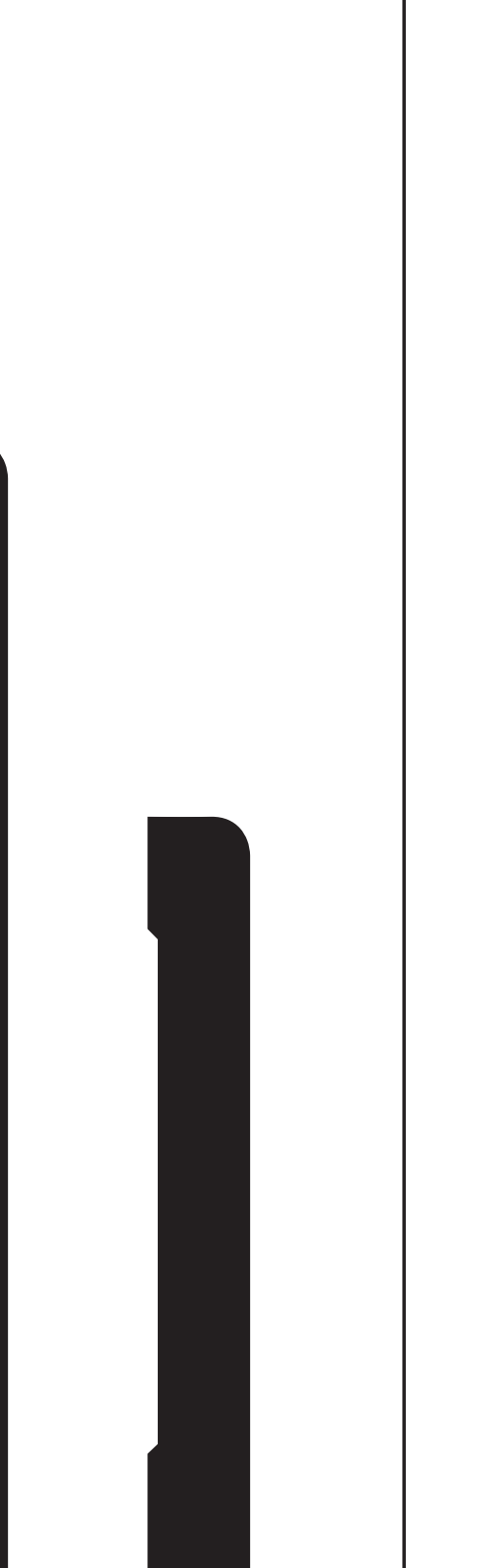
M623 12MM x 3-1/4