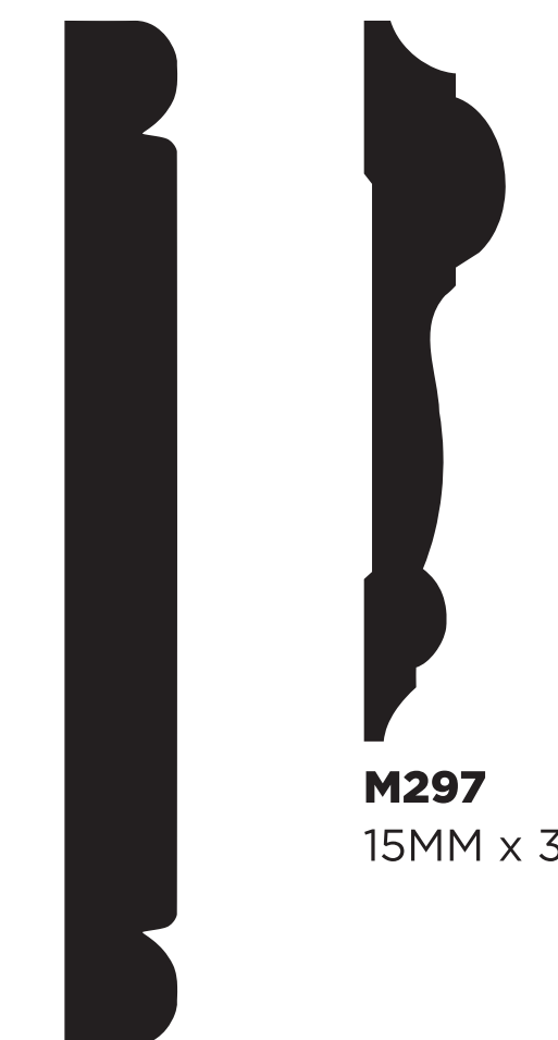
M297 15MM x 3